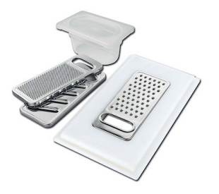
Graters kit with ring-holder and food collection tray

8159 101 * only in combination with the accessory 8644 101