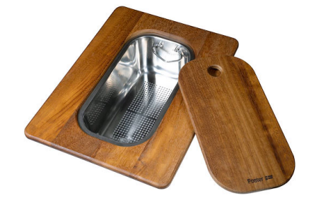
Iroko-wood sliding chopping board with stainless steel colander 8644 044

8159 101 * only in combination with the accessory 8644 101